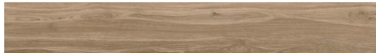
Origin Umber 22,5 x 180 cm

In the main bathroom, a box is designed for the shower and bathtub area, fully tiled and with a great visual effect, with large-format rectified porcelain tiles with a travertine-effect finish.