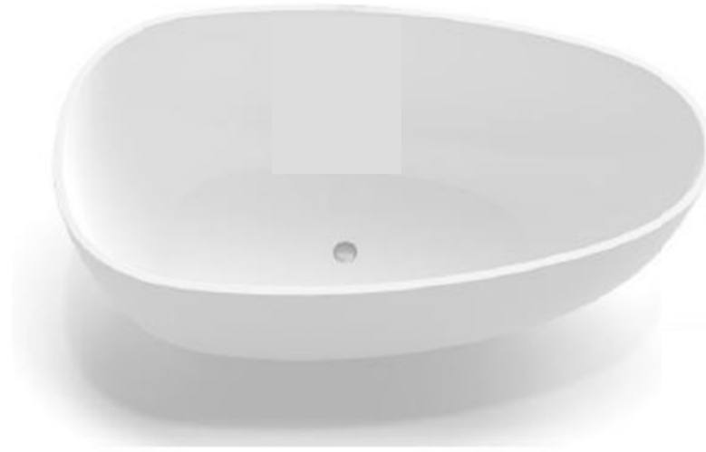
Non-binding figurative image

170 x 88 cm freestanding bathtub with floor-mounted tap.