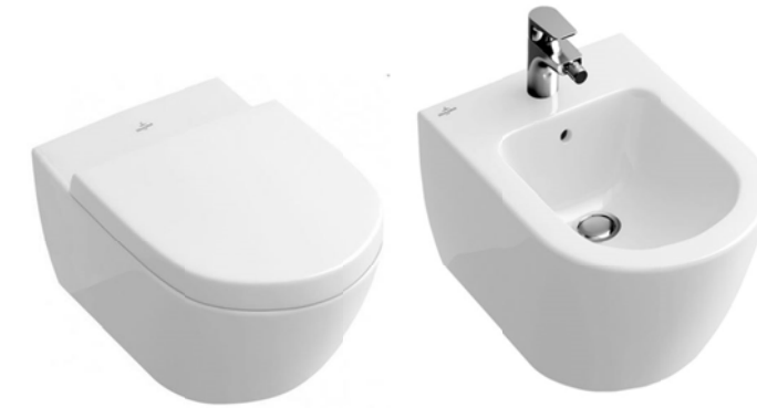
Non-binding figurative taps.

Wall-hung toilet with built-in cistern in enclosure with half and full flush button, cushioned seat and cover. Villeroy Boch SUBWAY 2.0 model, in all bathrooms and toilet. Bidet of the same model in master bathroom.